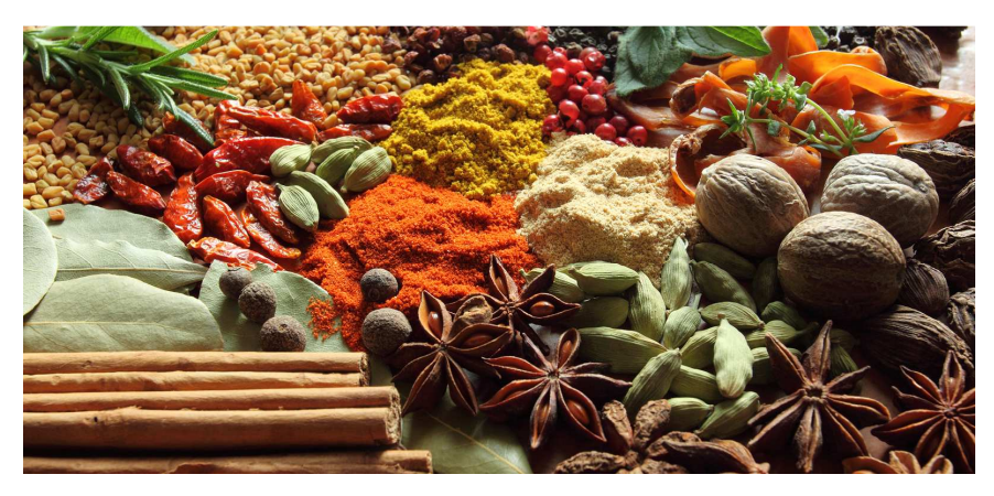
Enjoy cooking delicious meals from around the world with simple popular recipes and pre-portioned freshly ground spices for authentic flavor.